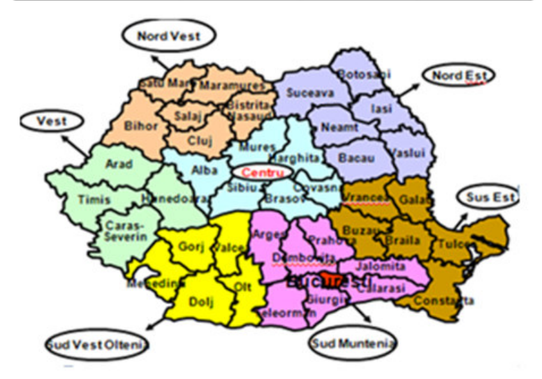
Figure 2 The geographical regions

In case the client has other financial obligations to pay (other monthly expenses), there will be decreased from the monthly net income together with the expenses that compose the minimum monthly in order to determine the net eligible income.